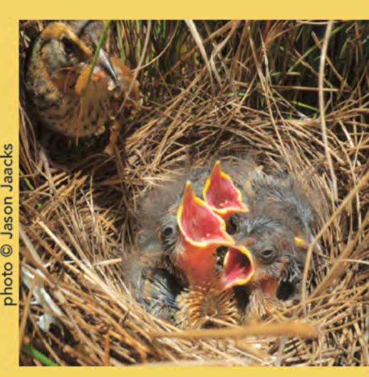
(above) chicks on the marsh (right) elevated Salt Marsh Sparrow nest

The WLT is proud to be a part of Warren's community fabric. We look forward to seeing you out on the trails - whether taking a walk, listening to the birds, or simply watching the sky.