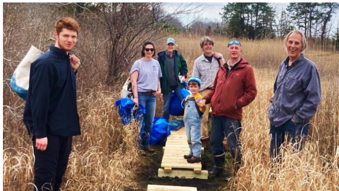
Trail team finishing up on new boardwalks at Haile Farm Preserve.