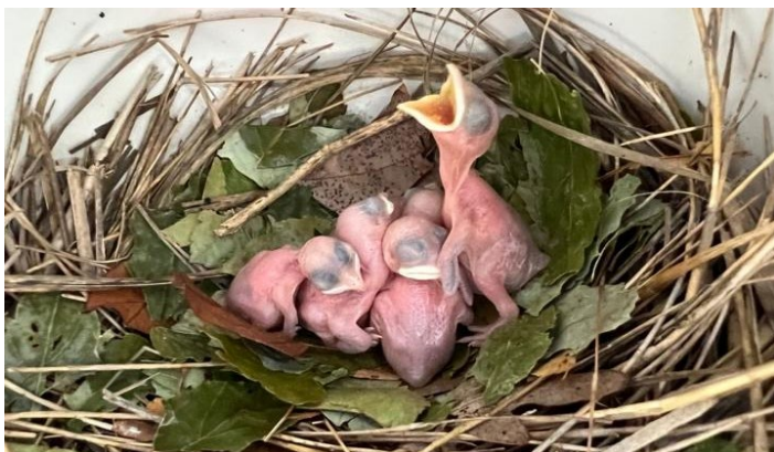
Purple Martin hatchlings

Forty-one Purple Martin chicks hatched and 28 Saltmarsh Sparrow nests established following the spring migration!!