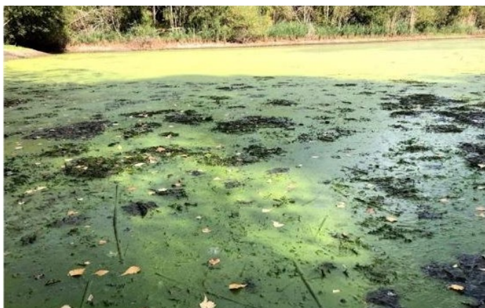
Toxic algae causing eutrophication at the detention pond.

The WLCT is currently working on a marsh and wetland rehabilitation project at the Haile Farm Preserve. The surrounding watershed and a manmade pond on the property have been contributing harmful pollutants and microorganisms to the marsh. A plan is being engineered in collaboration with Save the Bay and the Warren DPW to retrofit the pond and install upstream stormwater treatment practices to mitigate the damage caused to the Palmer River watershed.