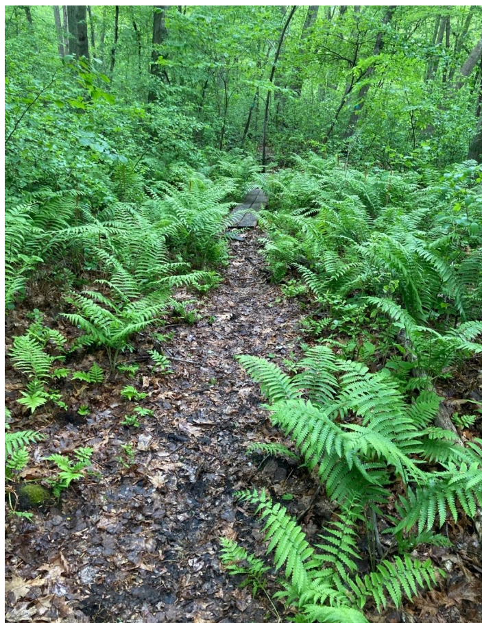
Dick Hallberg's Trail at Haile Farm Preserve

We are also working with the Town and its Conservation Commission to create a map of the open space properties in Warren that should be priorities for conservation efforts. This collaboration also includes the Nature Conservancy on some potential conservation easements. All these partnerships take a lot of time and a lot of calls and meetings, but they are essential to our ability to maintain and improve the valuable resources under our protection. We can't do it alone!