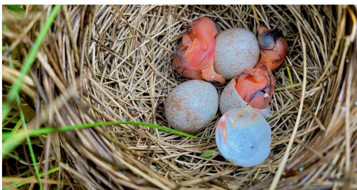
Saltmarsh Sparrow hatch day

One of our biggest challenges in providing proper stewardship of our properties is the need to manage collaboration with a variety of valuable partners. We have ongoing relationships with the Natural Resources Conservation Service (NRCS) of the USDA at both Haile Farm and Sowams Meadows. Save the Bay is also a partner at both properties, and they were instrumental in working with DEM, CRMC and the Army Corps of Engineers in obtaining permits to pursue restoration plans for both the salt marshes and the uplands. We have also been working for months with the EPA's Southeast New England Program and the Town of Warren on a stormwater management plan to address the contaminated runoff entering the Town's detention pond adjacent to our Haile Farm property.