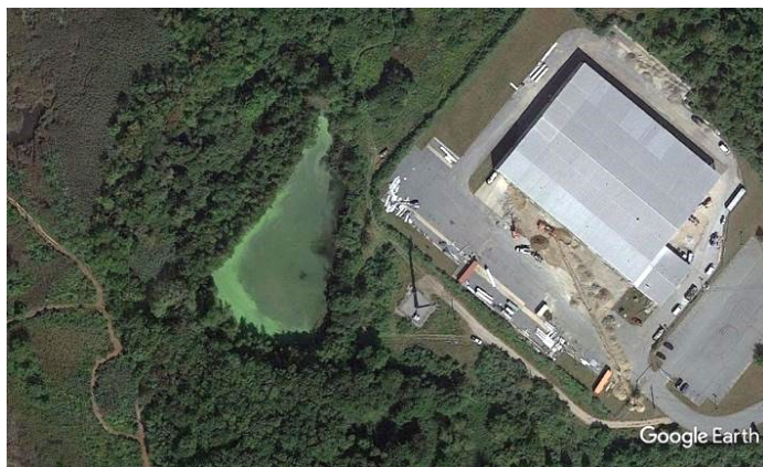
Google Earth satellite imagery showing bright green algae on detention pond in summer.

The WLCT is currently working on a marsh and wetland rehabilitation project at the Haile Farm Preserve. The surrounding watershed and a manmade pond on the property have been contributing harmful pollutants and microorganisms to the marsh. A plan is being engineered in collaboration with Save the Bay and the Warren DPW to retrofit the pond and install upstream stormwater treatment practices to mitigate the damage caused to the Palmer River watershed.