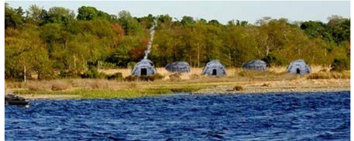
A Pokanoket village at Jacob's Point may have appeared as in this rendering

Sowams, an area of East Bay Rhode Island and nearby Massachusetts was the main settlement of the Pokanoket when the Pilgrims arrived. Governor William Bradford of Plymouth had been told that the land of the Pokanoket had "the richest soil, and much open ground fit for English grain, etc.," giving a hint of the conflicts over land that would soon develop.