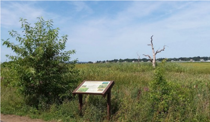
A summer day at Jacob's Point

The extension of the wine and beer event following the adjournment of the Annual Meeting capped an enjoyable evening. Plan to join us for future events.