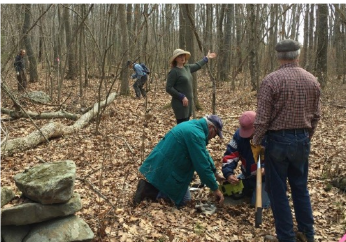
Work continues on Haile Farm Trails